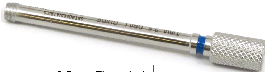
2.5mm Threaded Drill Guide 01-0903-0002