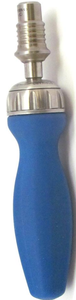
AO Ratchet Handle 01-1030-001