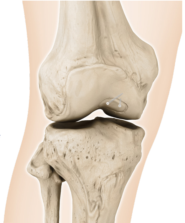
Example of an indication: OCD (Osteochondritis Dissecans) with ActivaNail™